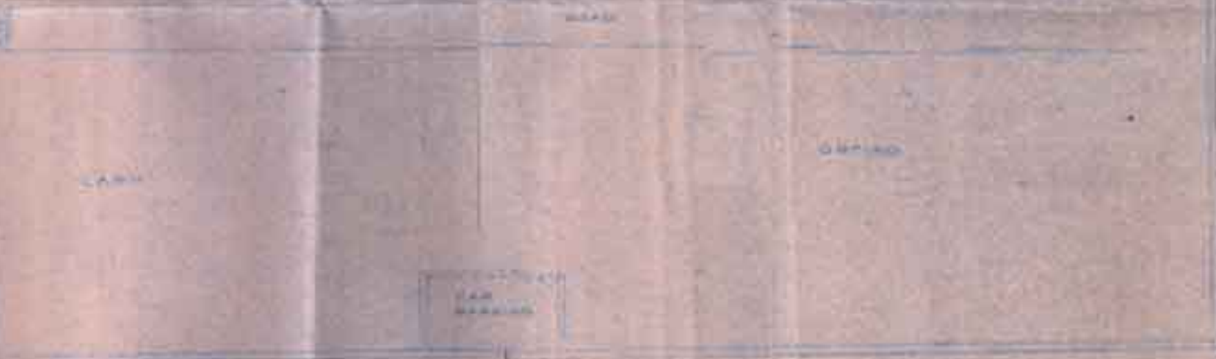
DESIGNING FLOOR PLAN